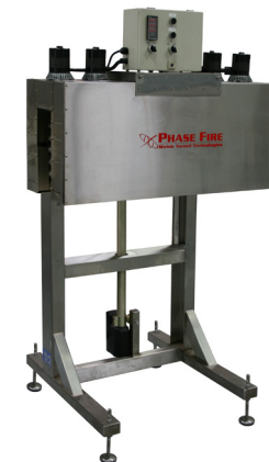
Optional powered height adjustable stand

2685 S. Melrose Dr. Vista CA 92081 • 760.734.4177 • Fax 760.734.4188 Email: Sales@AccutekPackaging.com • AccutekPackaging.com