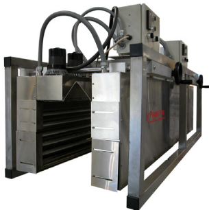
G3 Expandable tunnel